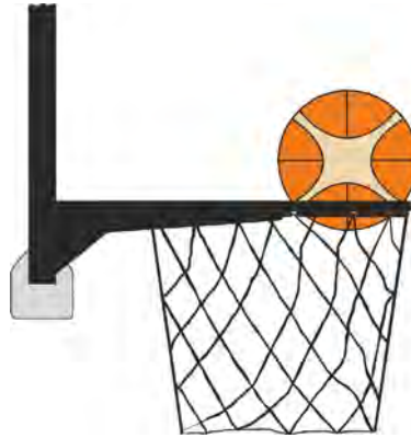
Diagram 3 Ball is within the basket

31-20 Statement. It is an interference violation if a defensive player touches the ball while the ball is within the basket.