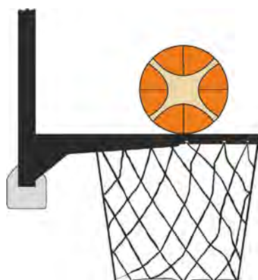
Diagram 2 Ball in contact with the ring

31-15 Statement. Interference is committed by a defensive or offensive player during a shot for a field goal when a player touches the basket or the backboard while the ball is in contact with the ring and still has a possibility to enter the basket.